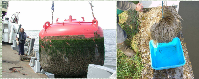
Buoys (left) and glass eel substrate (right), two examples of artificial substrates sheltering many exotic species

The Sea Scheldt comprises the brackish (Belgian-Dutch border to Burcht) and fresh water part (Burcht to Ghent) of the macrotidal Scheldt estuary. The port of Antwerp is situated in the brackish part of the river. Brackish harbour regions are considered particularly susceptible to introductions, because the diversity of native species is usually low and the import rate of new species (e.g. by ballast water) is high. Canals, inland navigation and active introduction are other possible ways for colonisation. Although there is no specific research program for exotic species in the Sea Scheldt and its tidal tributaries, they are regularly encountered during the monitoring campaigns for benthic infauna, as by-catch in the monitoring campaigns for migratory fish, on artificial substrates used for monitoring glass eel migration or on buoys.