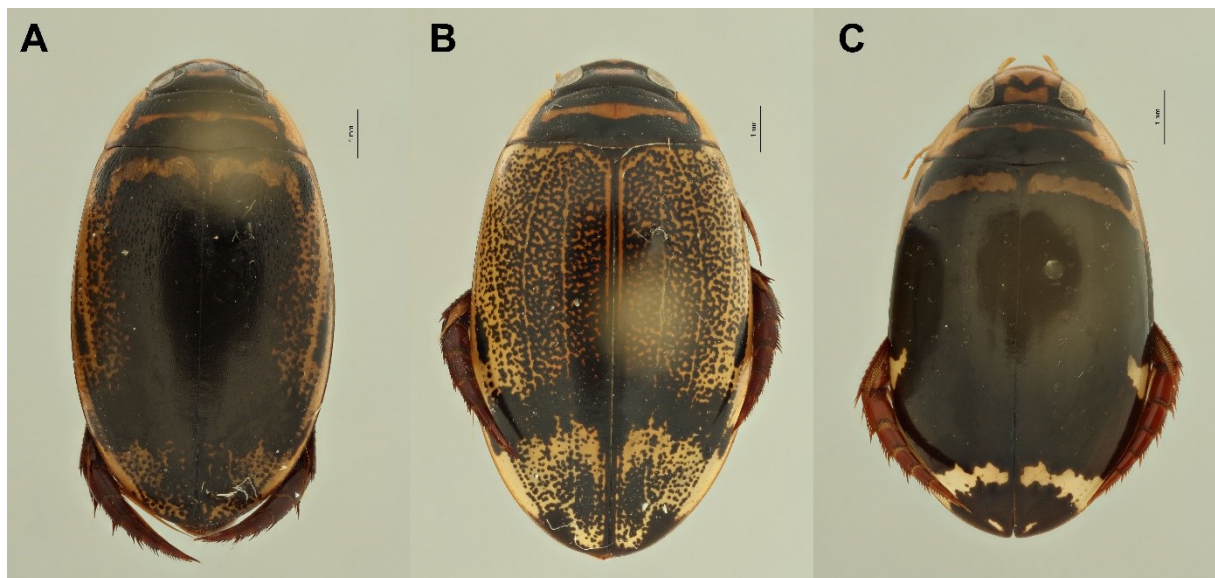
Fig. 1. Dorsal view of Thermonectus species in Belize: A, T. basillaris (Harris, 1829); B, T. circumscriptus (Latreille, 1809); C, T. margineguttatus (Aubé, 1838). Scale bar: 1 mm

HABITAT. This species is found in all types of lentic water, both permanent and temporary. Several specimens were attracted by light.