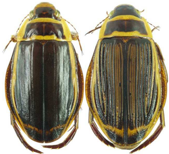
Dytiscus latissimus Linnaeus, 1758 male and female

All known Belgian records of Dytiscus latissimus and Graphoderus bilineatus are given in Table 1 and 2. It seems that D. latissimus and G. bilineatus , with respectively 12 and 19 localities (from which few locations with more than one record), have always been rare in Belgium. Both species were mainly restricted to the eastern part of Flanders (Campine region) and a small region near the city of Mons. G. bilineatus was also present at two locations near the city of Ghent (Fig. 1 and Fig. 2). The