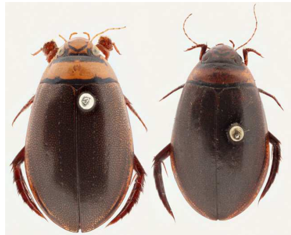
Graphoderus bilineatus (Degeer, 1774) male (Turnhout, 20.V.1943) and female (Geel, 13.IX.1930).