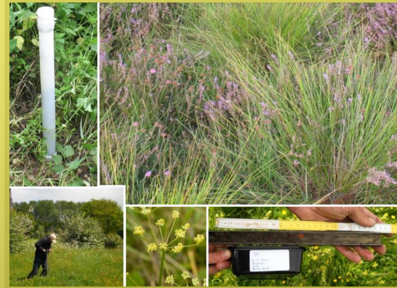
6230_hn P_Olsen (mg P/kg)

Criteria eutrophication, coverage indicators < 2%