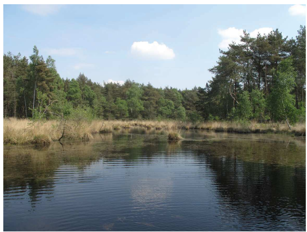
Fig. 3. Turfven II in the nature reserve Ophovenerheide. In this rather small oligotrophic lake with Sphagnum cuspidatum and Juncus bulbosus one specimen of Dytiscus lapponicus Gyllenhal, 1808 was caught in a baited trap.