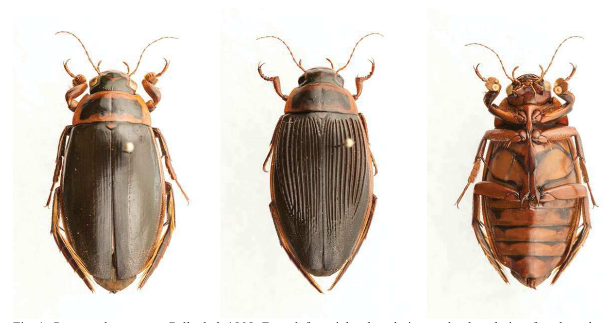
Fig. 1. Dytiscus lapponicus Gyllenhal, 1808. From left to right: dorsal view male, dorsal view female and ventral view male (collection K. Scheers).

On the ninth of June 2015 a trap, of the type 'Molchreuse', was placed in each of the five surveyed ponds in the nature reserve Ophovenerheide. These traps were baited with cat-food (14% beef and 4% liver) and left over night. In two of the traps Dytiscus lapponicus was caught with respectively one and six specimens. In the traps with D. lapponicus no other Dytiscidae were present. The other traps contained common species of water beetles: Dytiscus marginalis Linnaeus, 1758, Acilius sulcatus (Linnaeus, 1758), Acilius canaliculatus (Nicolai, 1822) and Colymbetes fuscus (Linnaeus, 1758). The trap at the Zwartven, where six specimens of D. lapponicus where present, was the only location where the exotic fish Umbra pygmaea (DeKay, 1842) was absent.