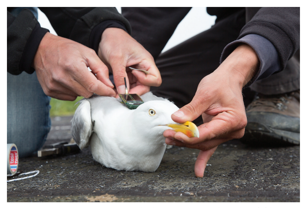
Figure 3. Researchers equipping a Herring Gull with a UvA-BiTS GPS tracker on the roof of the Vismijn in Ostend on May 24, 2013.

built-in tri-axial accelerometer as well. The system allows us to remotely set or change a measurement interval per tracker: the actual interval between measurements is provided in samplingEffort as secondsSinceLastOccurrence .