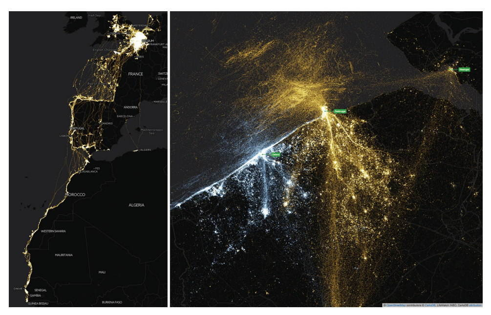
Figure 2. Left: map of western Europe and northwest Africa, showing the full extent of the gull tracking data, including two migration/wintering seasons. Right: map of the southern North Sea coast, showing mainly breeding season data. Each point represents a recorded occurrence, LBBG are indicated in orange, HG in blue. Overlapping points are brighter in colour. Maps created with CartoDB, basemap based on OpenStreetMap data. https://inbo.cartodb.com/u/lifewatch/viz/da04f120-ea70-11e4-a3f2-0e853d047bba/public_map