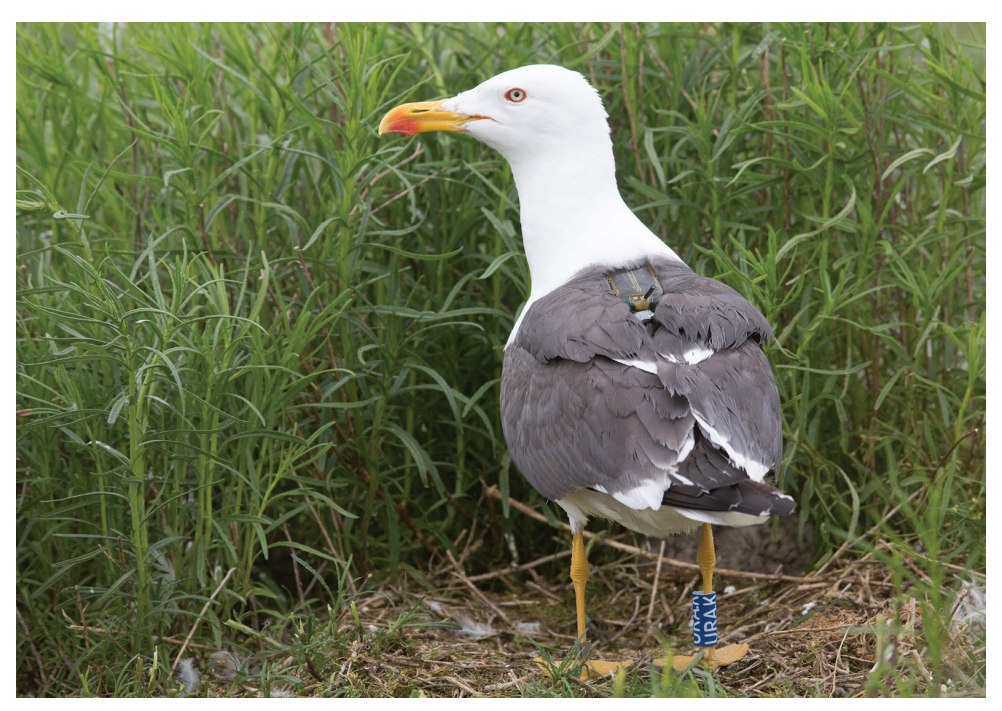
Figure 1. One of the tracked Lesser Black-backed Gulls ("Hans", ring code: L906682), photographed near its nest in Zeebrugge on May 29, 2013 shortly after he was equipped with a tracker (device info serial: 861).